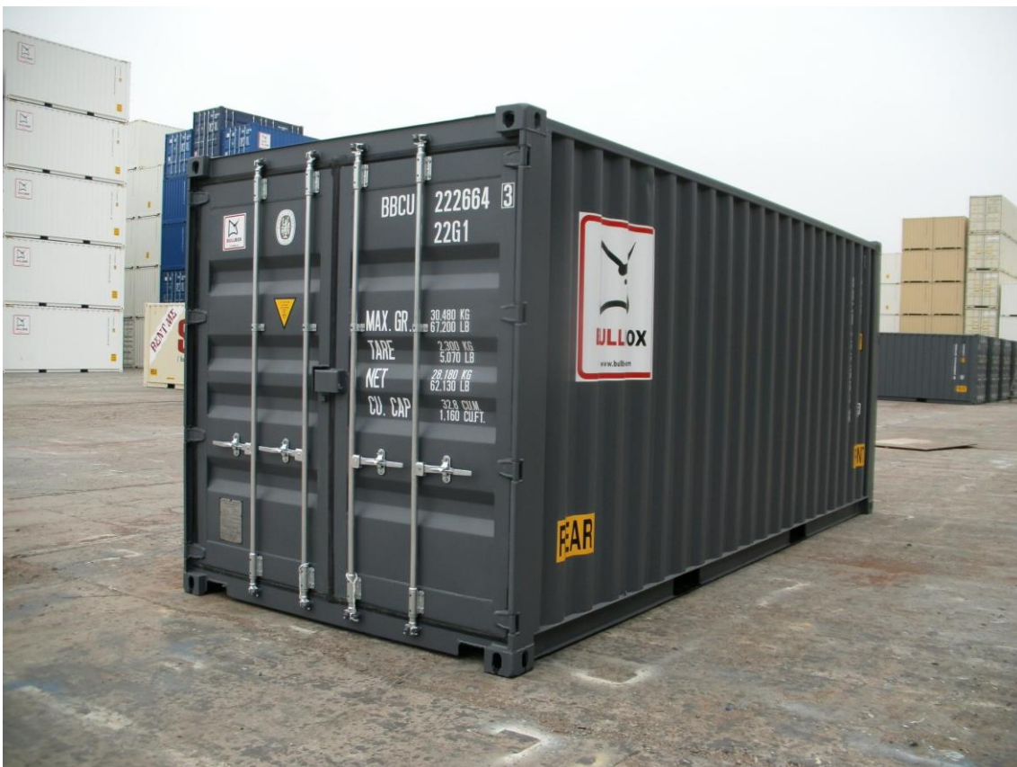
STEEL DRY CARGO CONTAINER BULLBOX 20' double doors x 8' x 8 '6"