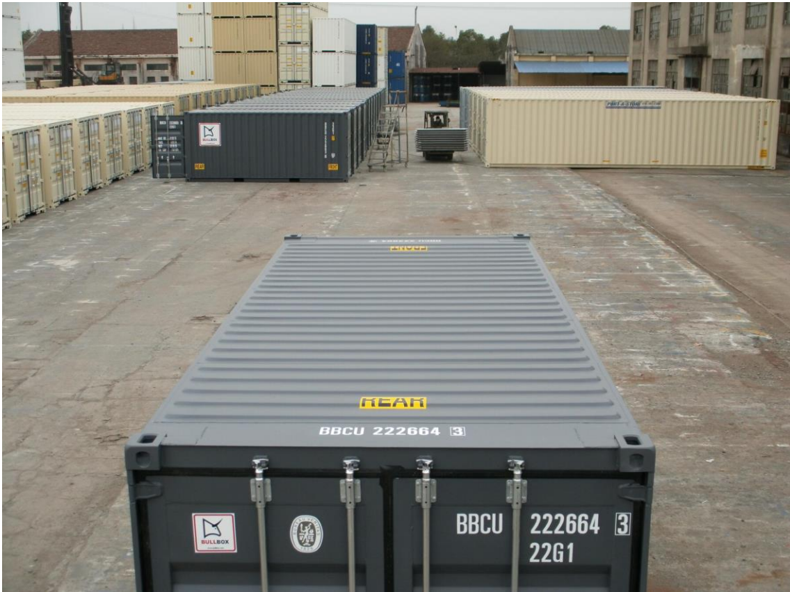
STEEL DRY CARGO CONTAINER BULLBOX 20' double doors x 8' x 8 '6"