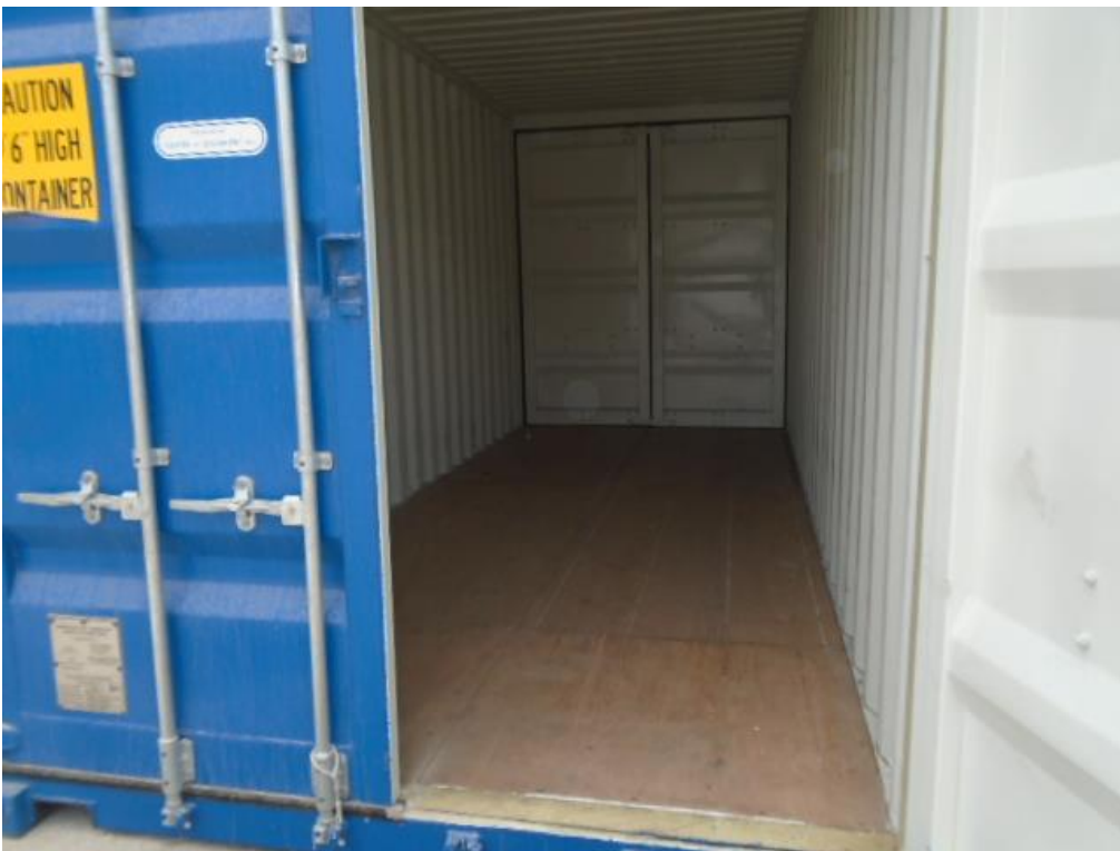
STEEL DRY CARGO CONTAINER ISO 1CC - 20' x 8' x 8'6"